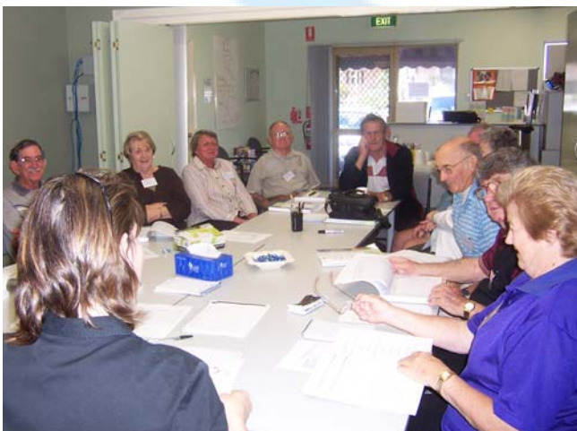
Chronic Disease Self Management (CDSM) course participants