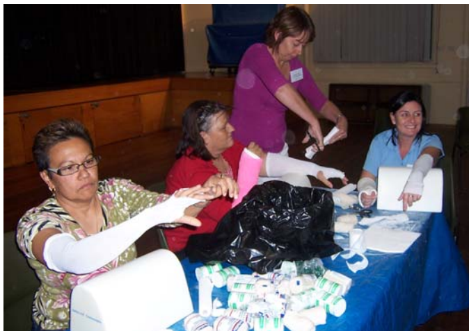
Plaster Cast Workshop for Practice Nurses